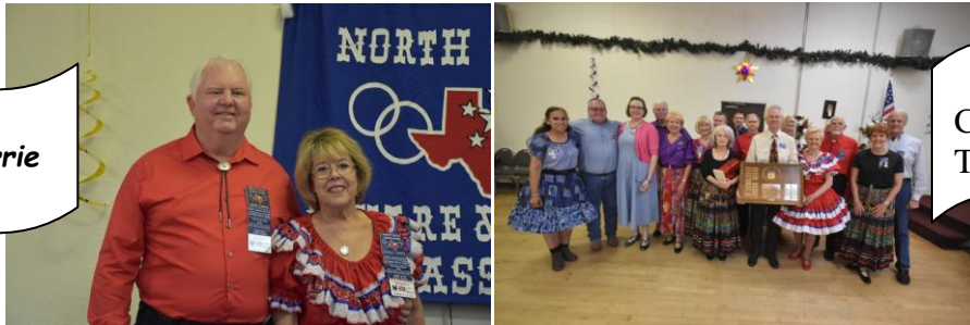
Club of the Year - Texas Reelers