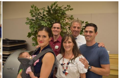
July 27 2018 Rockwall Squares Roundup