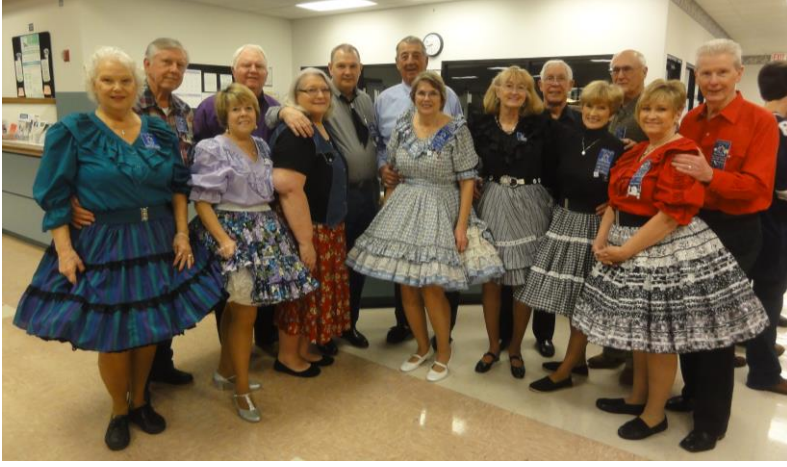
KUZZINS VISIT REBEL ROUSERS AND RETRIEVE OUR BANNER