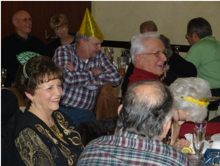
KUZZINS LAUGHING IT UP AT THE NEW YEAR'S EVE PARTY