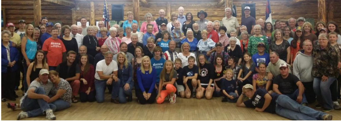
The Red River Gang 2014