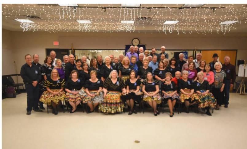
2018 KK 46 th Anniversary Dance – debuting new club skirt

*The entire history of the Kuzzins will be presented in a slide show at our Anniversary Dance