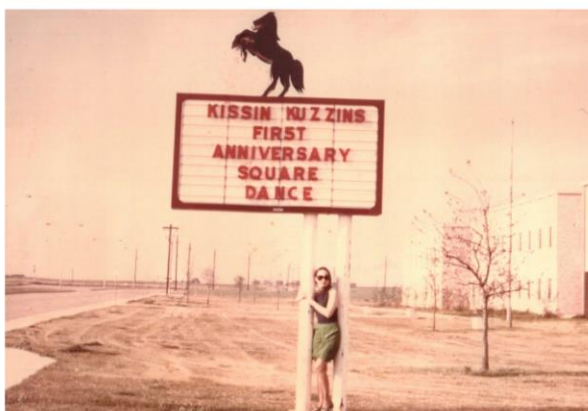
First Anniversary Dance advertising on JJ Pierce HS Marquee (no other information exists)