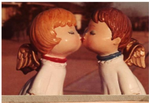
1972. The Idea of the Name of the Club