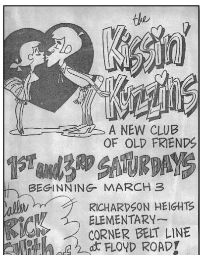
First-Ever KK Flyer