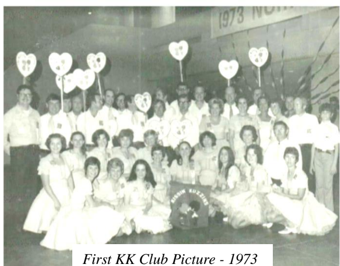
First KK Club Picture - 1973