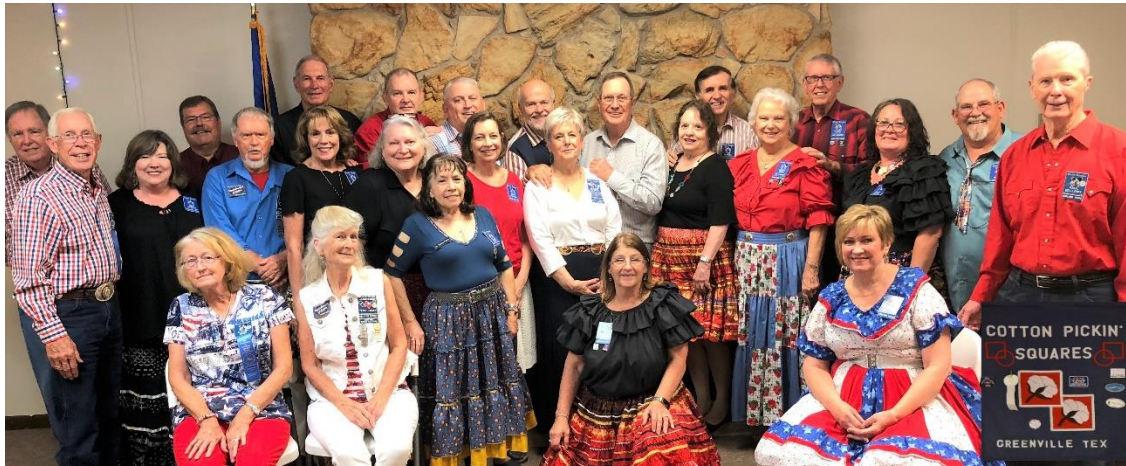
24!! Kissin' Kuzzins take a break from dancing to pose at the Greenville Cotton Pickin' Squares' Double Deal New Dancer on May 26.