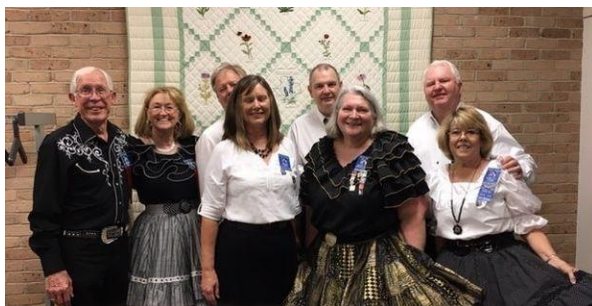
Visitation: Rebel Rousers - 2.18.2017 Black and White Dance