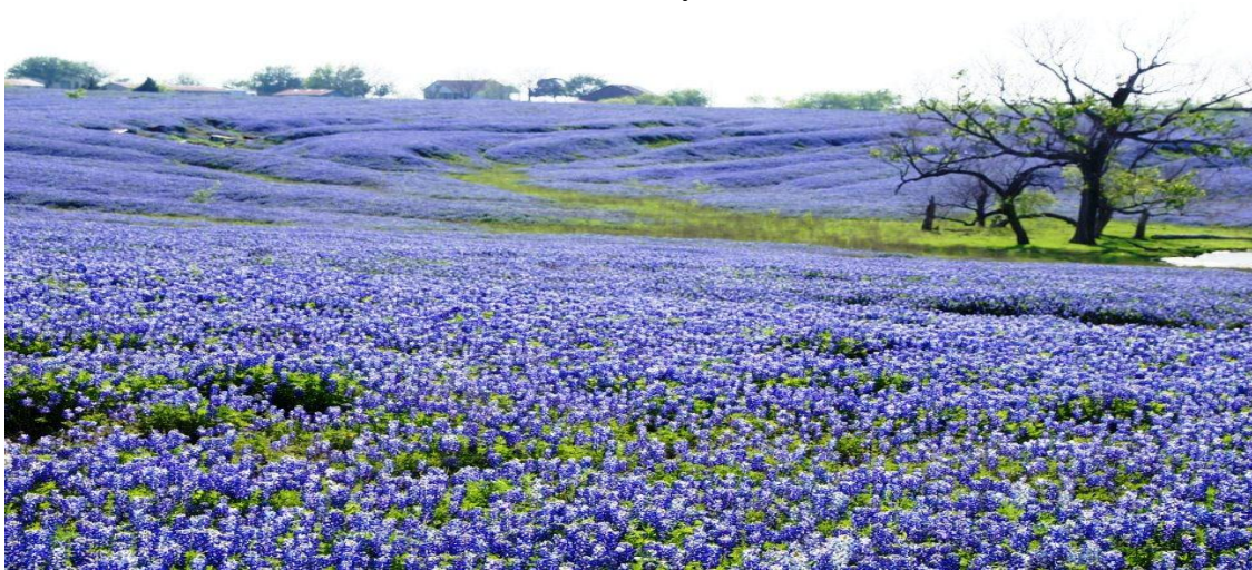
The Texas Bluebonnets are beautiful this year. It was taken on April 1, 2012 near Ennis, TX.