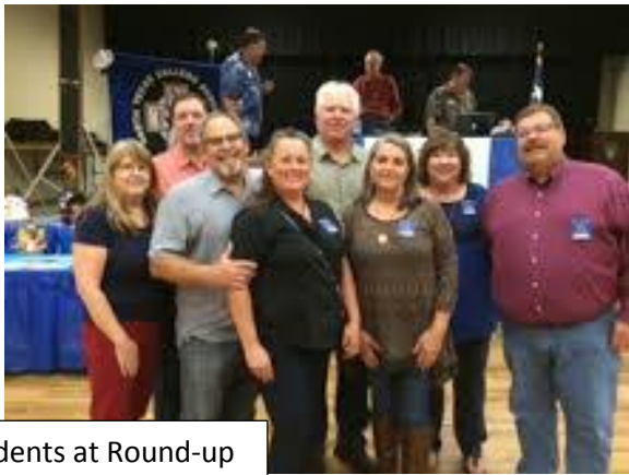
Students at Round-up