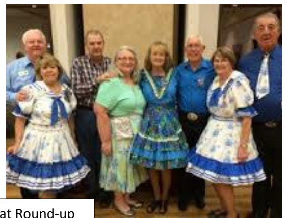
Kuzzins' at Round-up

Hope to have some pictures of visitations during the month of November.