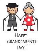
9/7 Grandparents Day