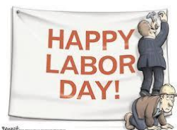
9/1 Labor Day