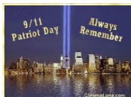
9/11 Patriot Day