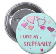
9/14 Stepfamily Day