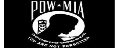
POW/MIA Recognition Day 9/19