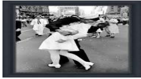
VJ Day 9/2