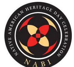
9/25 Native American Day